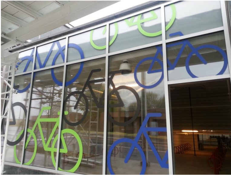
Wiehle-Reston East Metrorail Station Bikeroom