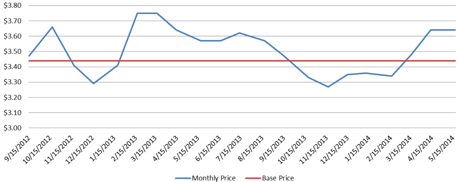
Metropolitan Washington Area Average Fuel Prices June 2012 ($3.44) - May 2014 ($3.64)