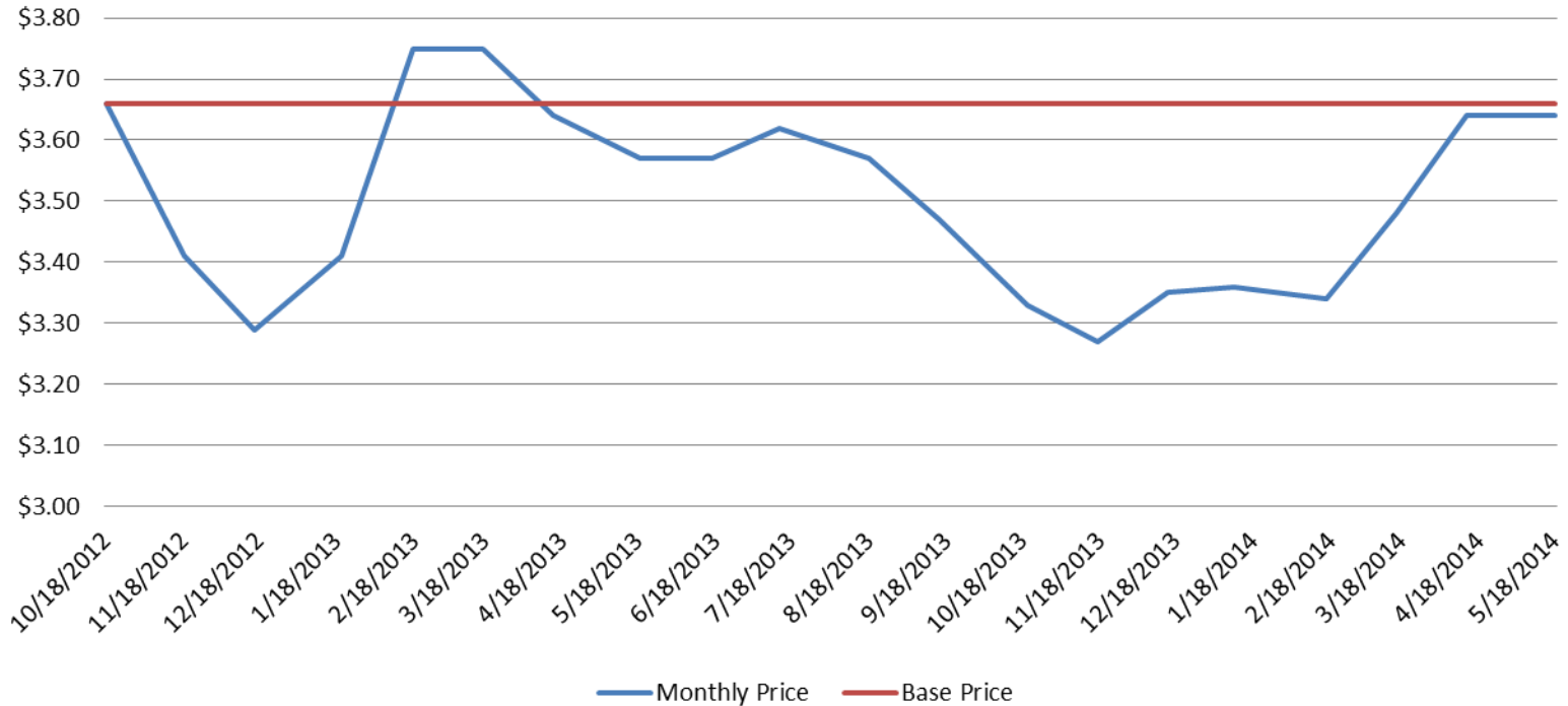
Metropolitan Washington Area Average Fuel Prices October 2012 ($3.66) - May 2014 ($3.64)