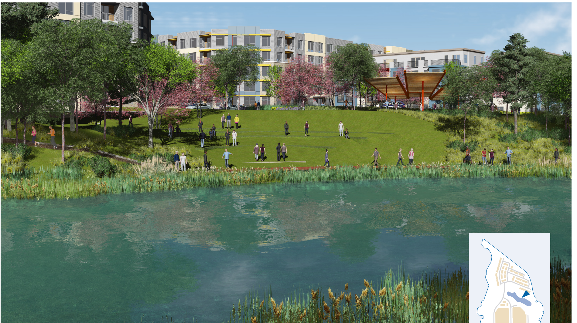
VIEW ACROSS POND TO AMENITY AREA