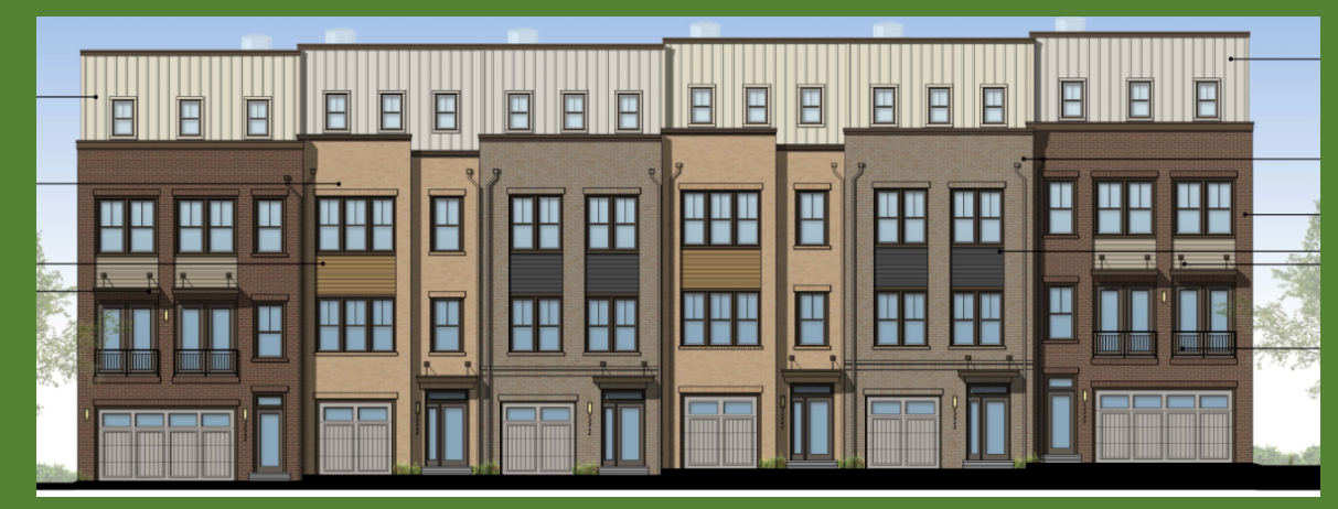
Front Load Towns