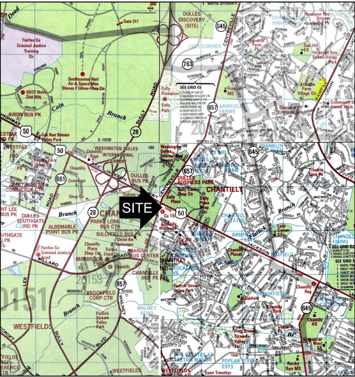
VICINITY MAP SCALE: 1" = 2,000'

22. IN ACCORDANCE WITH SECTION 2-308(4) OF THE ZONING ORDINANCE, UPON APPROVAL OF THIS SPECIAL EXCEPTION APPLICATION BY THE BOARD OF SUPERVISORS, THE APPLICANT AND PROPERTY SHALL RECEIVE DENSITY CREDIT FOR THE PUBLIC STREET DEDICATIONS SHOWN HEREON OR OTHERWISE PROVIDED AS PART OF THE PROPOSED USE. (SUCH DENSITY CREDIT MAY BE USED, AT THE PROPERTY OWNER'S DISCRETION, AT ANY TIME IN THE FUTURE.)