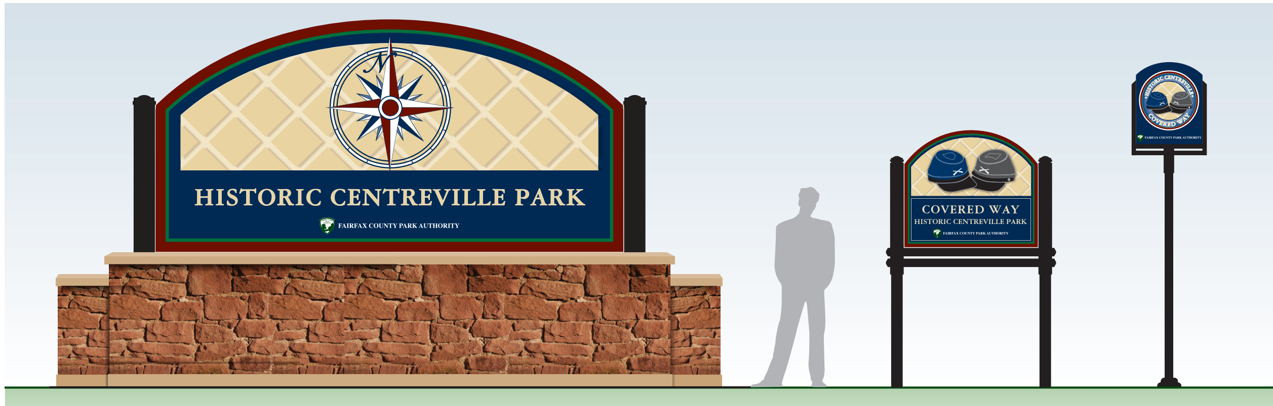
GI MONUMENTAL GATEWAY SIGN