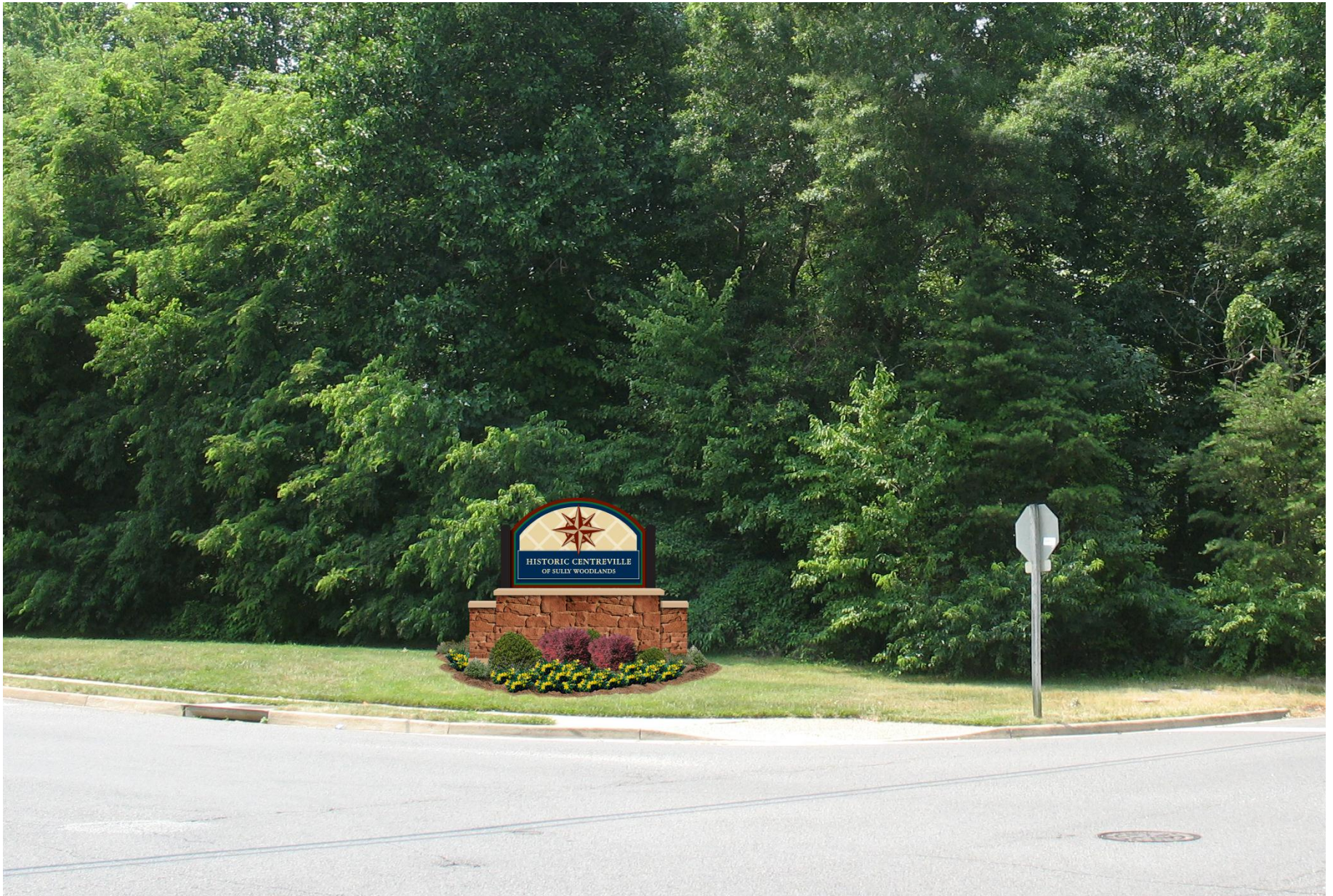
Historic Centreville Gateway – Photo Simulation