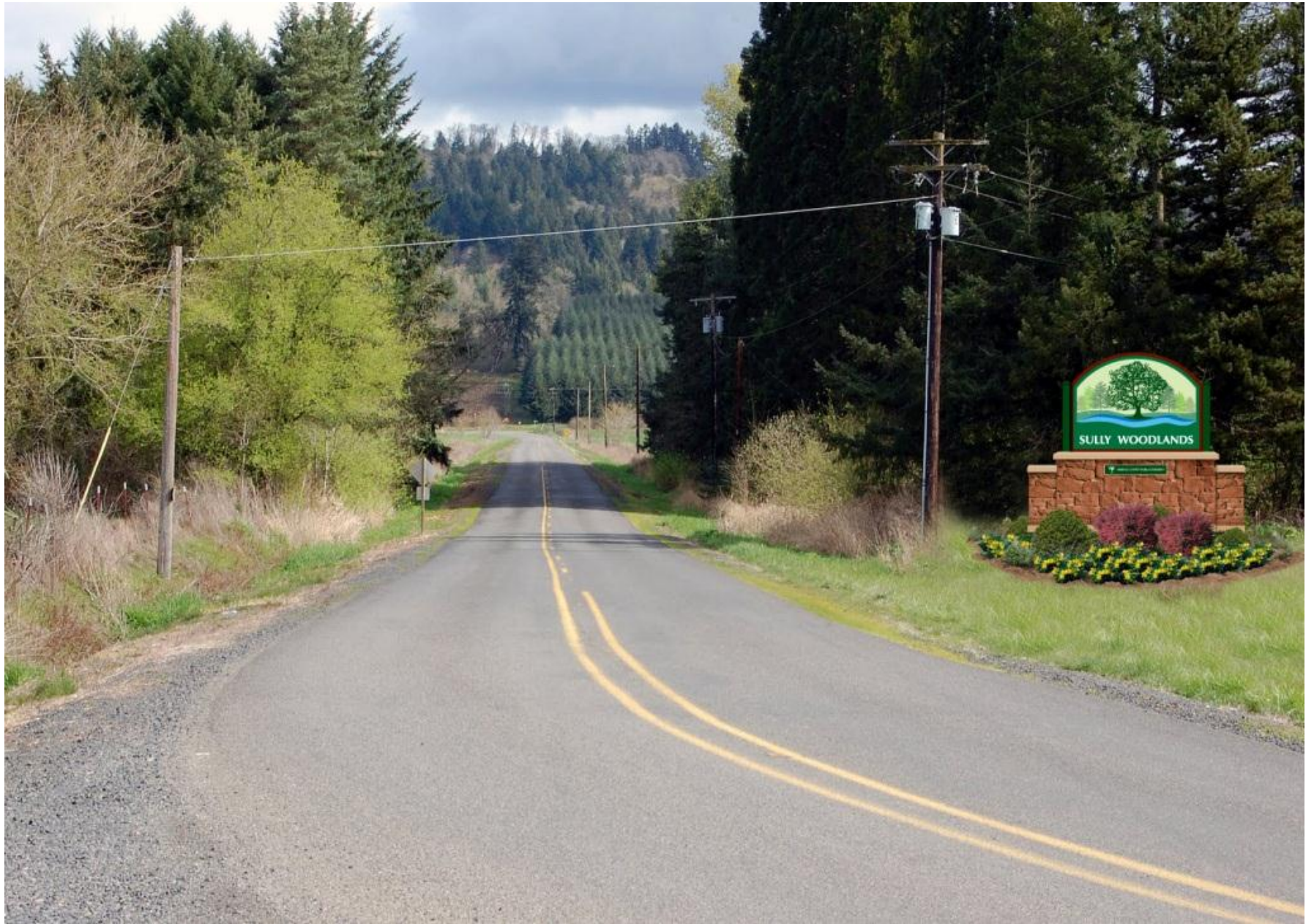
Sully Woodlands Gateway – Photo Simulation